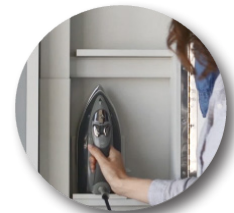
Hot Iron Rest

Download specification sheets, installation instructions, and more to assist in your model selection at www.ironaway.com